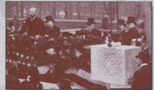
The hero is one who kindles a great light in the world, who sets up blazing torches in the dark streets of life for humanity to see by."

If you feel the call to put ethics into action to preserve and expand our American Democracy, the Social Service Board is set up to energize, empower, and facilitate the ideas and needs of ethical people.